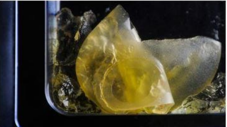
PIP breast implant scandal

Current EU legislation does not classify fillers as a medicine or drug, but as a medical device, so the scrutiny is less intense. EU medical device regulations only require products to carry a CE or European conformity marking. These disturbingly minimal regulations place the onus on consumers to rely on claims from distributors and manufacturers about the safety and performance of their products, which can be risky. Therefore, choosing a qualified practitioner who can be trusted to offer rocksolid recommendations and operates a professional and fully registered clinic is essential.