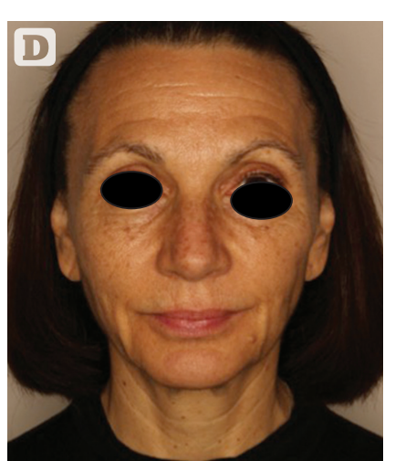
Figure 2 Patient with 2 sutures per side placed in midface. (A,C) Pre and (B,D) post 4 months.

*Ellanse is a registered trademark of AQTIS Medical BV, PERFECTHA is a registered trademark of Sinclair Pharmaceuticals Limited, SCULPTRA is a registered trademark of Valeant (Galderma).