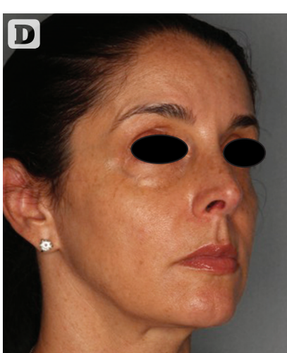
Figure 1 Forty-seven year old female patient sought Silhouette InstaLift with Julius Few, MD, to lift the mid-face while adding volume for a natural outcome. This patient had Silhouette with pre (A,C) and post (B,D) photos at 18 months.

\triangleright stimulates fibroblast activation and collagen production, restoring shapeliness to the face.