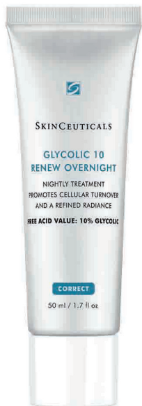
SkinCeuticals Glycolic 10 Renew Overnight

▷ patented formulation has been proven to increase skin hydration by improving skin barrier function, as well as increasing the production of hyaluronic acid and natural moisturising factor (NMF). Skin looks smoother, brighter, and more supple,' said San Antonio, TX dermatologist Vivian Bucay.