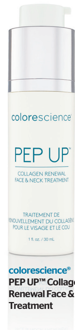
colorescience® PEP UP™ Collagen Renewal Face & Neck Treatment