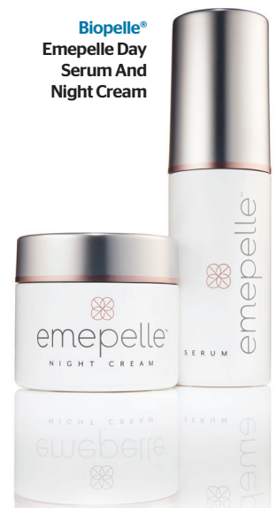
Biopelle® Emepelle Day Serum And Night Cream