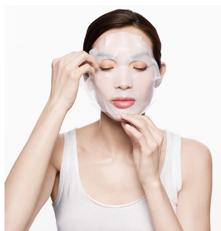
Topix Pharmaceuticals Biocellulose Recovery Mask Brightening Boost Pigment Correcting Cream