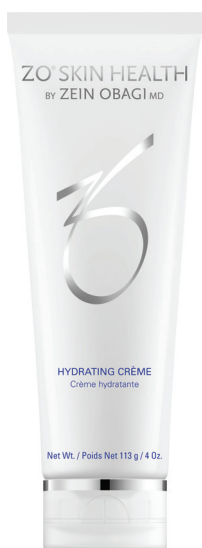
ZO Skin Health Hydrating Crème