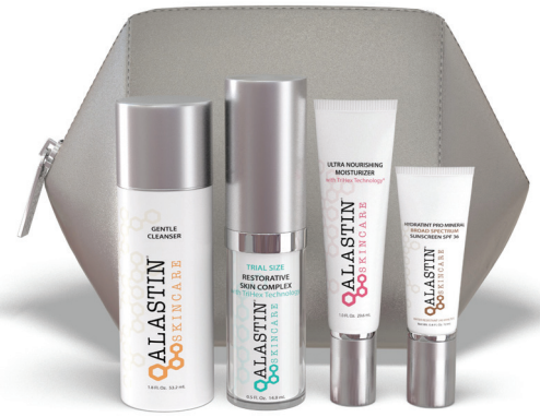
ALASTIN® TriHex Preview Regimen With TriHex Technology®

I'm impressed with the innovation of PEP UP's formulation—a unique blend of ten peptides combined with cutting-edge antioxidants and ingredients for hydration. In both the clinical study, which we participated in, and at our practice, we've seen significant improvements in skin texture and tone in patients who >