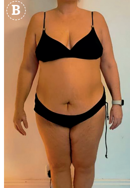
Figure 2 Female patient (A) before (102 kg) and (B) 16 weeks after balloon placement (83 kg)