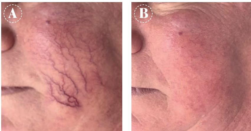
Figure 4 Before and after treatment for vascular lesions using the ETHEREA-MX®.