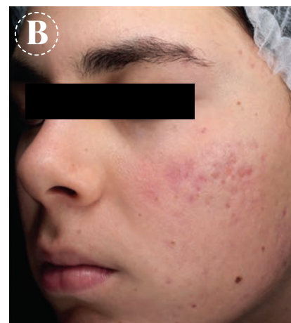
Figure 1 Before and after treatment for acne scars using the ETHEREA-MX®.